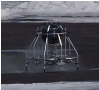
Fig. 1. Flying Test Bed.

To achieve the control for the FTB, the PID controller combined with discrete time interval has been designed. Figure 2 shows one of the examples of the simulation result with the error in the installation angle on the main thruster. Although there is strong delay and error in the installation, the control law keeps the roll and pitch angles with-in 3 degrees. Also, we can see that the yaw angle diverges because of the small yaw thrusters compared to the main thrusters. More results will be shown in the proceedings/presentation and we are expecting the results of the flying test in the end of FY2016 can be compared with the simulation results.