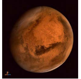
Figure 2: MOM's First Picture of Mars