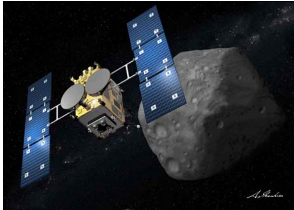
Artist's image of Hayabusa-2 Spacecraft